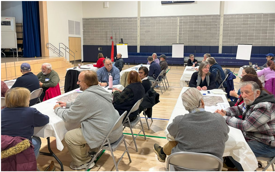
Participants at the Public Workshop