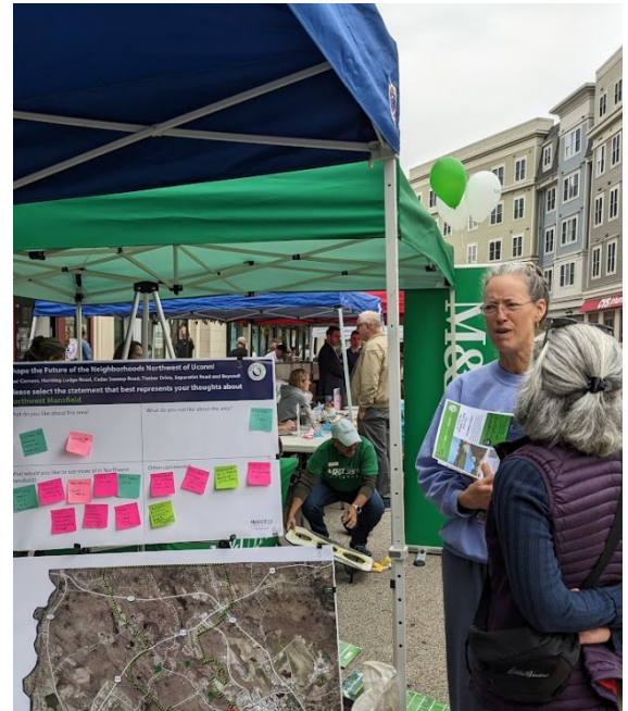
Participants providing comments during Celebrate Mansfield Day