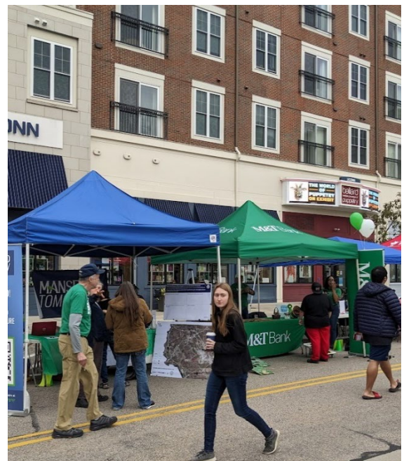
Mansfield Tomorrow table at Celebrate Mansfield Day